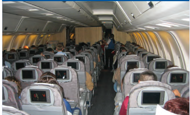
FIGURE 1 Aircraft cabins are high occupancy density, with air currents moving aerosols along four or more rows longitudinally either way, making social distancing impractical and infectious aerosol exposures more likely, while the low cabin humidity weakens our immune system's defense against infections. Humidity is kept low by ventilating with very dry outdoor air that needs to be humidified and also by the continual loss of cabin humidity from the recirculation air due to the movement of a portion of the cabin air to behind the insulation where the moisture in it condenses and freezes on the cold skin and fuselage.

divided by the number of persons in the space), outdoor air supply per person and the rate of virus-filtered air supply per person.